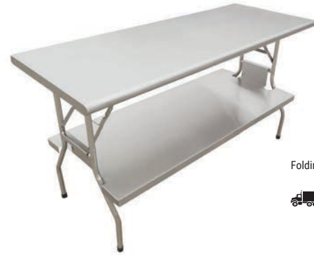
Folding table with undershelf