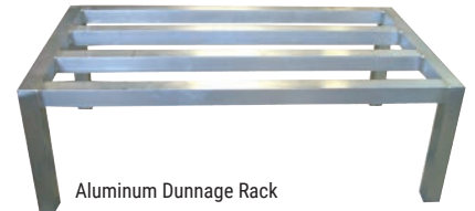
Aluminum Dunnage Rack