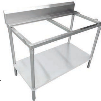
Solid Poly-Top Tables with 6" Backsplash