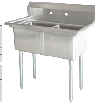
TwoTub Sink with No Drain Boards