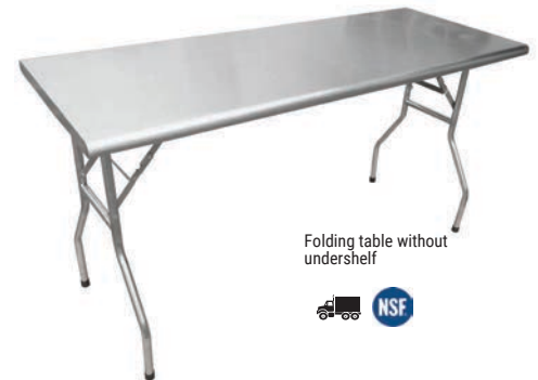
Folding table without undershelf