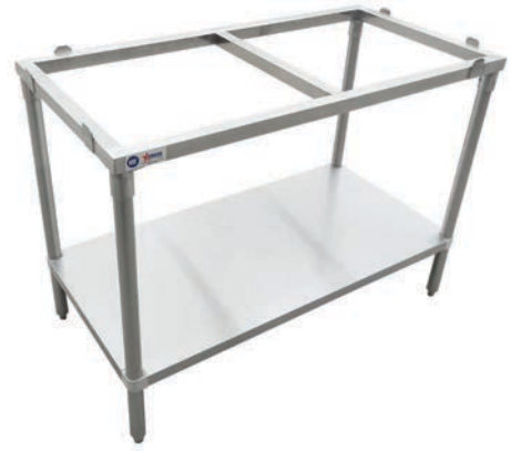
Solid poly-Top Tables