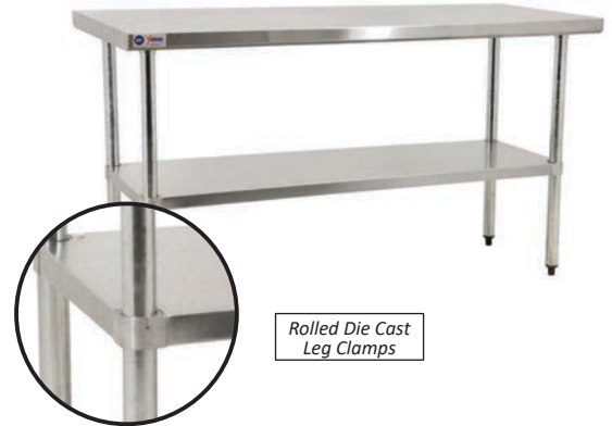
Rolled Die Cast Leg Clamps