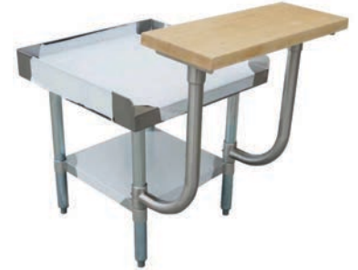
Wooden cutting board attached to the equipment stand