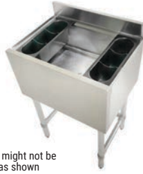
Product might not be exactly as shown