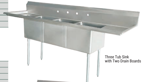
Three Tub Sink with Two Drain Boards