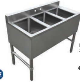
Product might not be exactly as shown