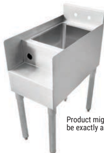
Product might not be exactly as shown