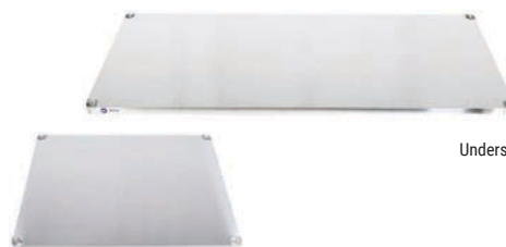
Undershef for poly-top table