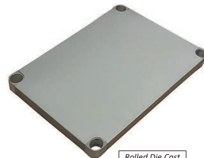
Rolled Die Cast Leg Clamps