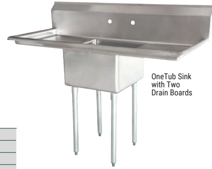
OneTub Sink with Two Drain Boards