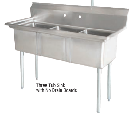
Three Tub Sink with No Drain Boards

website: www.omcan.com email: sales@omcan.com call: 1.800.465.0234 fax: 905.607.0234