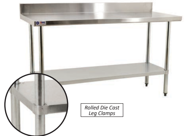
Rolled Die Cast Leg Clamps