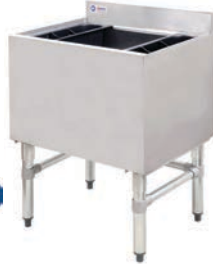
Product might not be exactly as shown