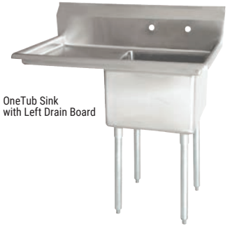
OneTub Sink with Left Drain Board