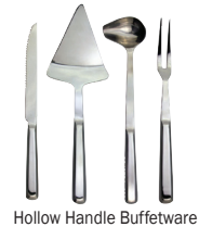
Hollow Handle Buffetware

Item Capacity 80146 Carving Knife, 8" 80147 Two Tine Fork, 11" 80148 Wide Pie Server, 11 1/2" 80007 Spout Ladle, 1 oz