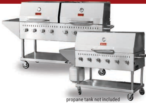
propane tank not included