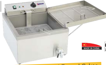
Ideal For Donut and Funnel Cakes